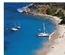
Views from the islands of Puerto Rico and St. Maarten