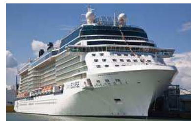
The Eclipse was launched April, 2010